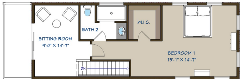
2 ND FLOOR – 742 SQ FT