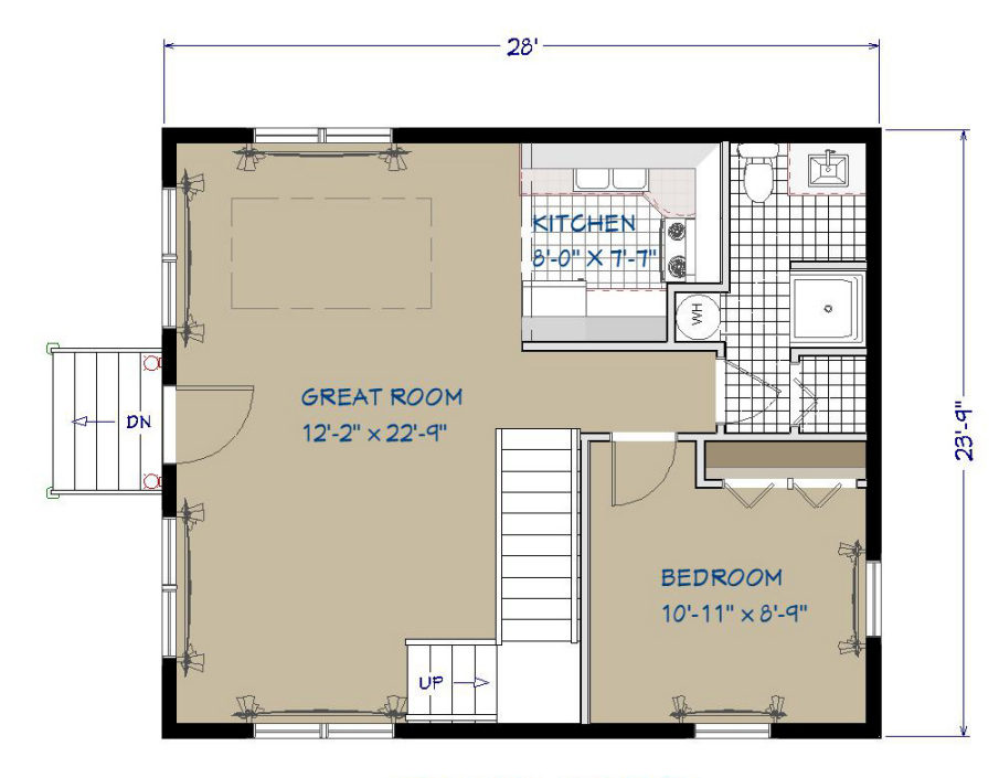
FIRST FLOOR - 672 SQ. FT.